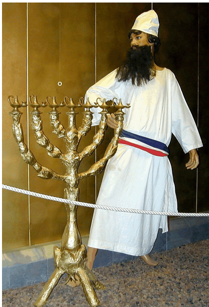
Replica of Candlestick used in the Tabernacle

The vision for John started when he heard a voice that sounded like a trumpet telling him to write down what he was about to see and to send it to the seven churches in Asia. Trumpets were loud and were used to proclaim events which seems to be